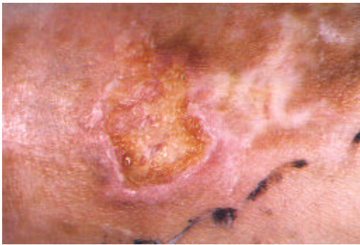
Fig. 1. An unhealed wound with yellowish oozy crust 4 weeks after the procedure of epidermal grafting.