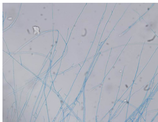
Fig. 2. Microscopic figure of Trichophyton rubrum from case 1 showed teardrop-shaped microconidia and long hyphae stained with lactophenol cotton blue ( \times 400 ).

tinea pedis and tinea unguium. T. rubrum was isolated from the wound exudate of the patients. Colonies of T. rubrum cultured on the Sabouraud dextrose agar were white and fluffy showing red color on the reverse side (Fig. 1). Microscopic examination of T. rubrum cultured on the Sabouraud dextrose agar revealed teardrop-shaped microconidia and long hyphae (Fig. 2).